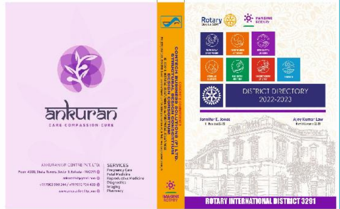
District Directory is available in hard copy. Interested members please submit names with Club President. Rs. 400/- Per Copy.