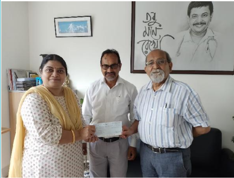
On 7th September, 2022 Rotary Behala handed over a cheque of Rs 25,000/- to Netaji Subhas Chandra Bose Cancer Hospital, New Garia towards treatment of less privileged patients.